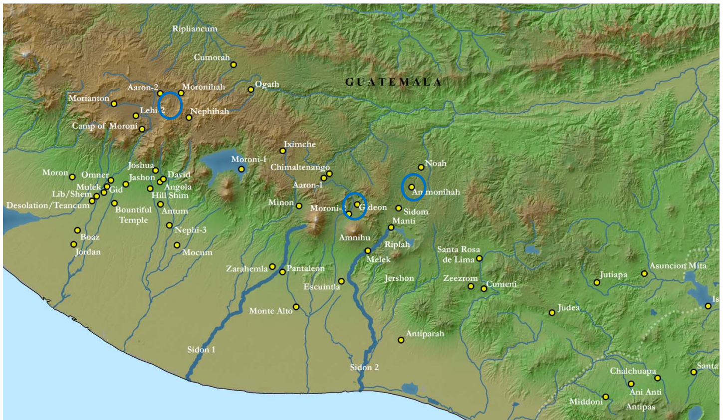
Figure 2. Existing and extinct lakes. (see zoom-able map at mormontopics.com )